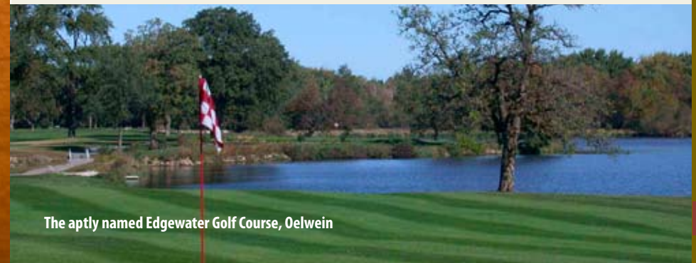
The aptly named Edgewater Golf Course, Oelwein

Woods Edge Golf Course Hwy 3 West Edgewood 563-928-6668