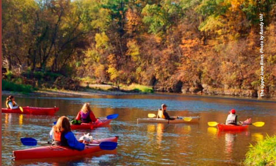
The Upper Iowa River