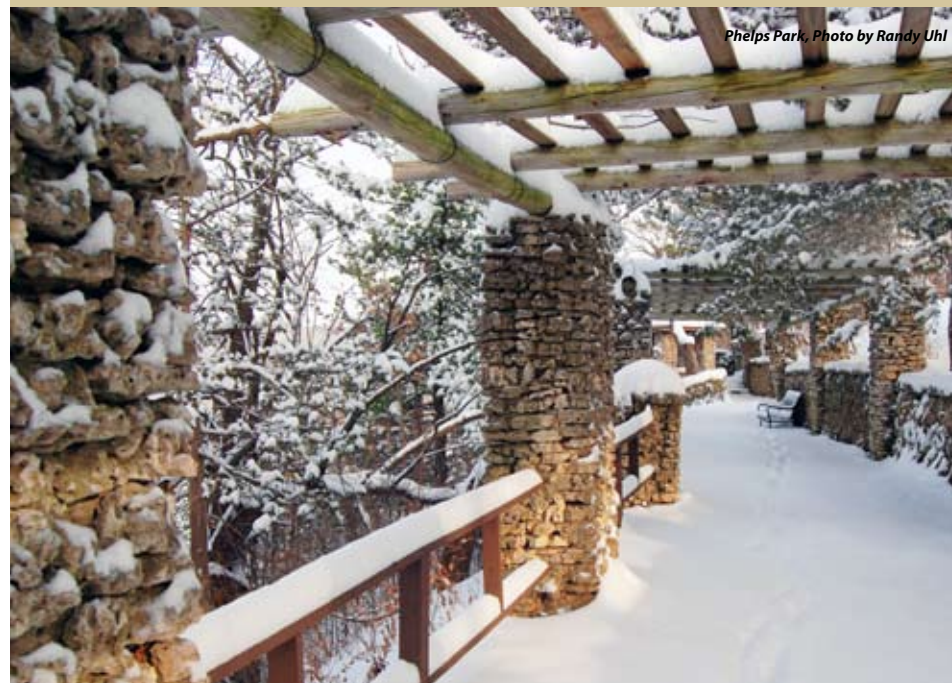
Phelps Park