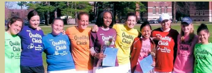
Visitors from around the world travel to Decorah Chick Hatchery to find out if they are "Quality Chicks." Are you?

Full-service bike shop that can repair all brands and custom build any bicycle. Carries Giant, Jamis, Surly, Salsa and Redline bicycles, accessories, skateboards and disc golf equipment.