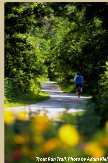
Trout Run Trail

Iowa's largest wind farm and an Old Order Amish community, you'll experience history, folklore, a butterfly garden and natural resources along this captivating trail.