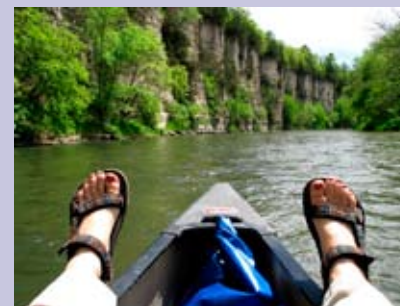
Upper Iowa River

Meandering back and forth across river valleys between bluffs and small historic communities. The winding nature of the river and the fact that it has more canoe access points than any other river of its length allow visitors to create short or long trips on the river with little road transport time between them.