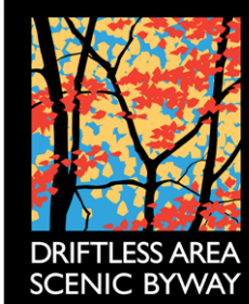
DRIFTLESS AREA SCENIC BYWAY