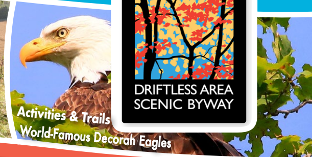
Activities & Trails World-Famous Decorah Eagles