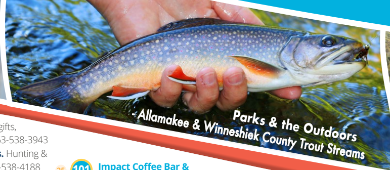
Allamakee & Winneshiek County Trout Streams