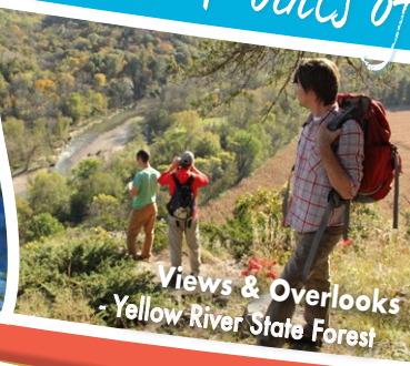
Views & Overlooks Yellow River State Forest